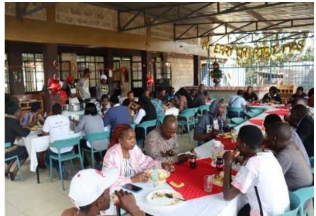
MPC Staff Christmas Lunch

Throughout the year, we focused on strengthening education, supporting vulnerable families, and advocating for sustainable development in Mukuru.