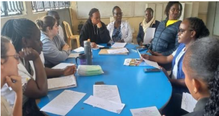
MOH brief at the staff room

The Clinic had the privilege of hosting support supervision by the Ministry of Health (MOH) Tuberculosis Coordinator, who reviewed adherence to TB drug regimens. The coordinator, in recognition of the Clinic's achievements, congratulated it on its excellent progress in sputum collection and maintaining an accurate presumptive screening register, as well as documentation of the Appointment register and patient follow-up. This recognition serves as a source of pride and motivation for the Clinic's efforts in combating TB within the community.