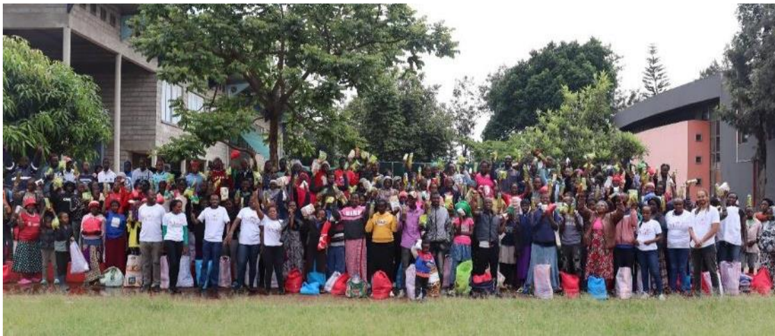
Whistle Foundation Ireland donate Christmas parcels to Needy Families

Needy families who sought help were served and supported on a need-basis, with most needs requiring food support and clothing aid. As we approach the end of the year, we are deeply grateful to our donors, partners, and the community members who have generously given their time, resources, and support throughout the year. Your selfless contributions have made a significant difference in the lives of the vulnerable families in the Mukuru community.