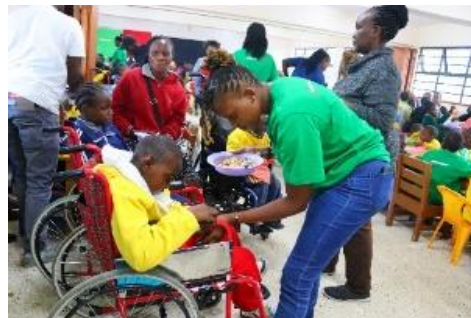
Sharing a meal