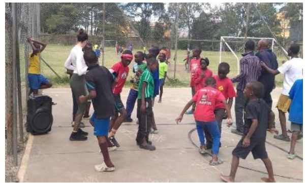
The boys show Africa some dance moves

Among all the visitors in December, the daily activities continued at the Centre. Counselling sessions were conducted in preparation for the festive season, exiting the Centre, and other customs. The carpentry boys have completed their exams and are brimming with enthusiasm to start their attachment. Their eagerness to sharpen their skills and utilize them to become sustainable and financially independent is a source of hope and optimism.