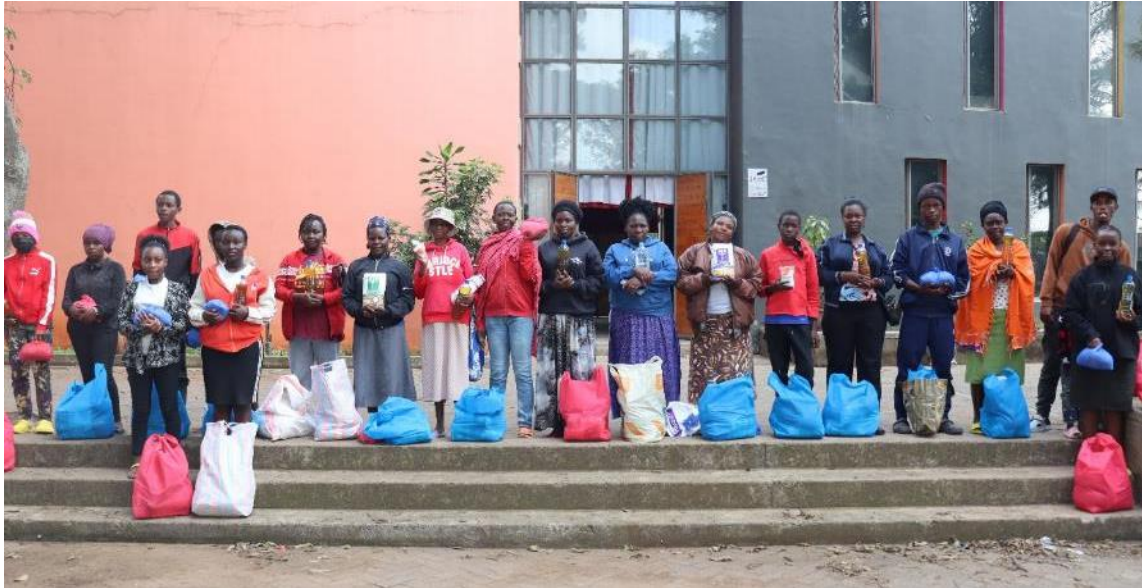
Fondo donates food packages to needy families

The clinic social worker continued to follow up with the sick children under MPC medical support. A good number of these children received medical attention during the year and have fully recovered. However, it's important to note that a few cases of chronic and terminally ill children still need our close follow-up and support going forward. The month also saw a reduced number of clients who received waivers at the Clinic as many families travelled upcountry for the festivities.