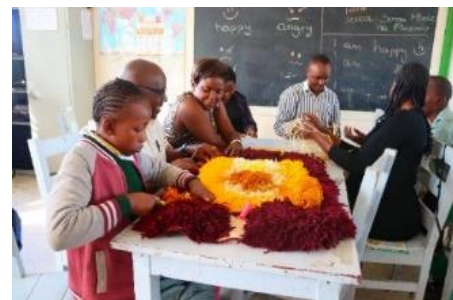
BOC Staff and Unit 3 children

Staff from BOC Gas visited the Centre and assisted the children with some basic skills in tapestry work.