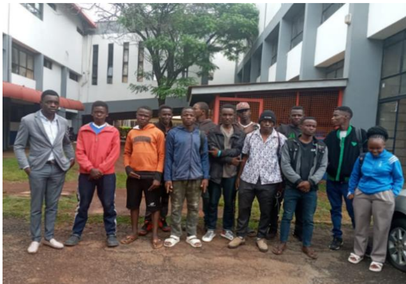
Welding candidates at NITA examination Centre