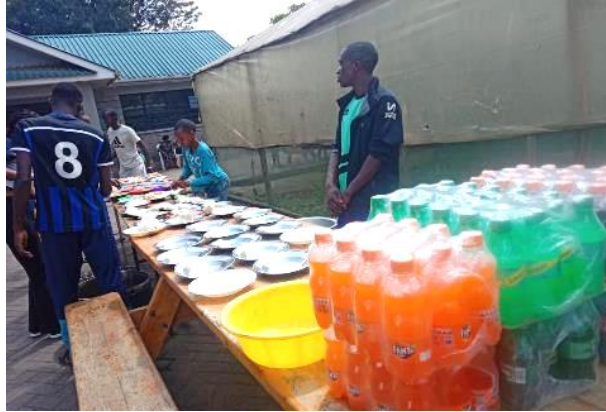
The boys serving lunch