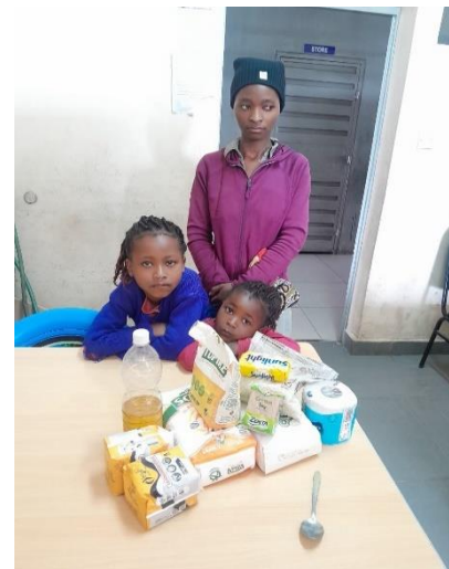
Kayaaba Needy Family

The social workers have focused on facilitating the establishment of close to 40 business startups for victims of floods and demolitions. These startups, which are part of the recovery program, range from small-scale retail shops to agricultural ventures, providing these families with the means to earn a living and provide for their families. In addition, teenage mothers have been provided with care packages, including baby clothes and hygiene materials, to assist them in caring for their babies. Furthermore, some of these young mothers have also been given the opportunity to start their own businesses, such as tailoring or hairdressing, thereby enabling them to support themselves and their children, a crucial step as a majority of them are single parents.