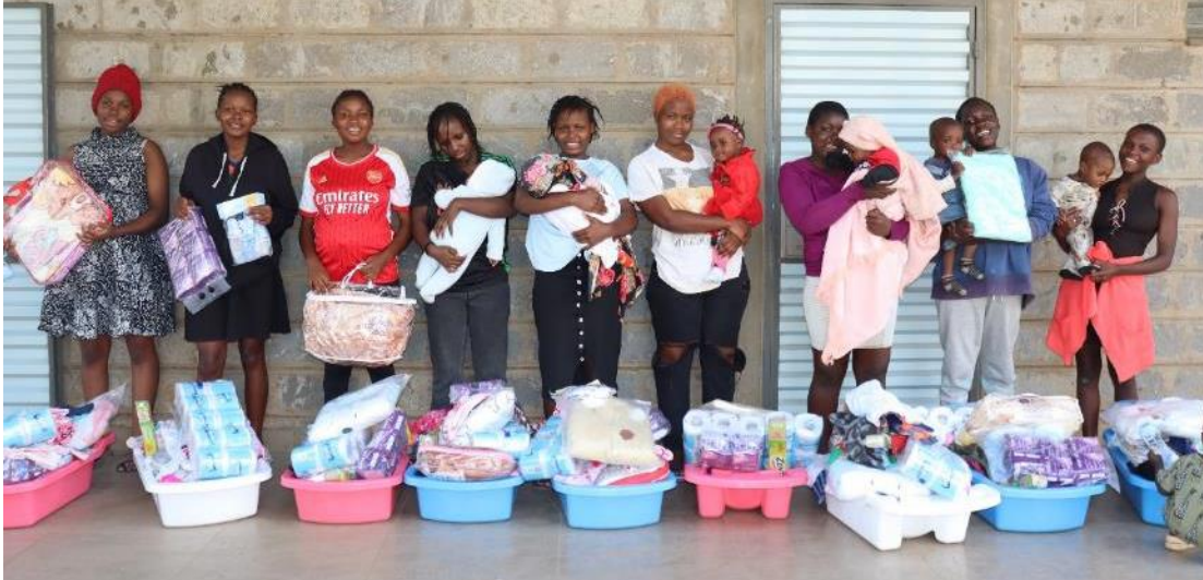
United Nations Women's Guild donated materials for Teenage Mothers and Care Packages

Needy families who sought help were served and supported on a need-basis, with most needs requiring food support and clothing aid. As we approach the end of the year, we are deeply grateful to our donors, partners, and the community members who have generously given their time, resources, and support throughout the year. Your selfless contributions have made a significant difference in the lives of the vulnerable families in the Mukuru community.