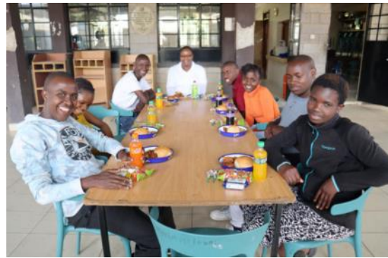
Special Education students with their finished products