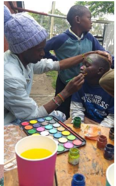
Christmas Day 2024