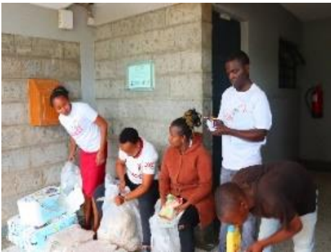
Whistle Foundation Christmas Food Parcels

The Centre's work, supported by local and overseas visitors, has had a significant impact on the families it serves. The families received much-needed maize meals, cooking oil, green grams, beans, and rice, which helped alleviate their food insecurity. The Whistle Foundation Ireland, for Christmas, sponsored food parcels for 100 parents, providing them with essential items. In addition, 31 parents were issued with clothes and shoes, further improving their living conditions.