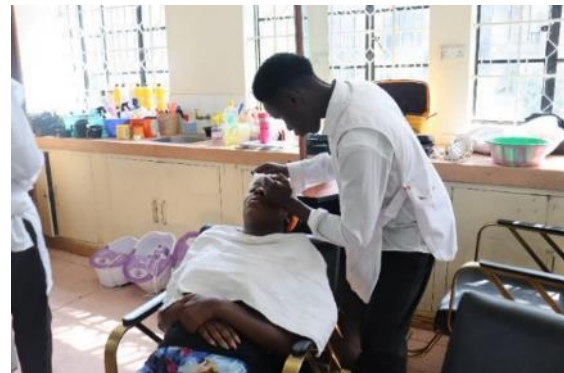
Hairdressing and Beauty Therapy