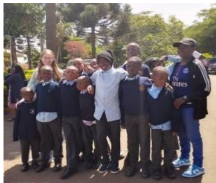
The Rehab Boys and Teachers at Marianist University