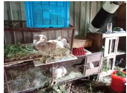
Chicken and rabbits living in the gym temporary.