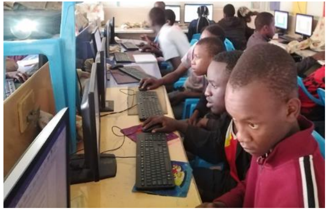
Computer Packages Final Exam