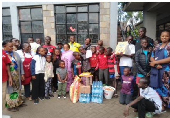
Blessed Anuarite Small Christian Community with the donations