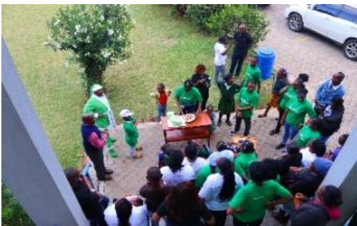
Cake cutting with Safaricom staff

Staff from Safaricom visited the Centre, shared a meal with the children, and donated items. They hope to return in 2025 to help improve children’s lives.