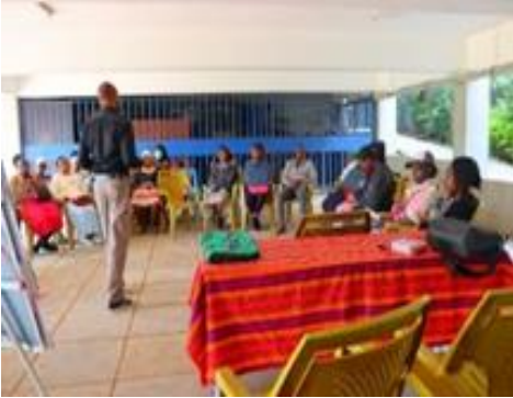
Songa Mbele parents during group counselling