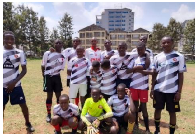
The boys after winning a local tournament match