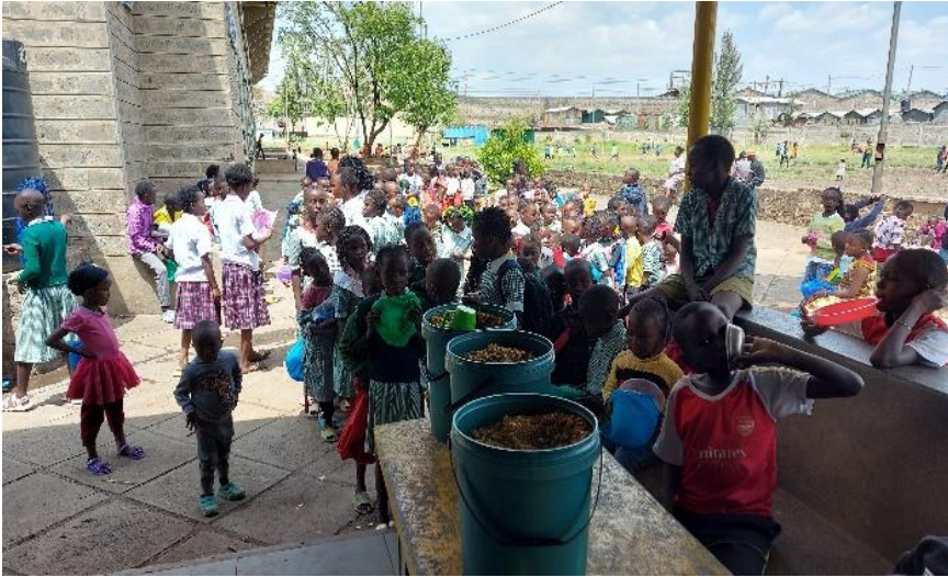
St Elizabeth Primary School Holiday Feeding Program

The four primary schools continued to feed children during the month of December, which they took home to share with their siblings. The program has been beneficial for parents and pupils, and providing the meals means the children reduce the prevalence of anememia and boost family incomes, paving the way for a healthier and more prosperous future, particularly in times of economic crisis.