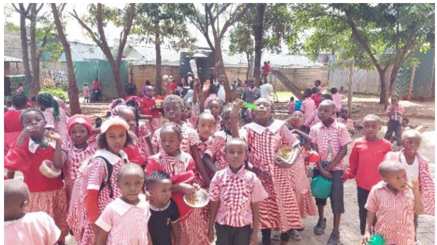
Sancta Maria Primary School Kayaaba Holiday Feeding Program