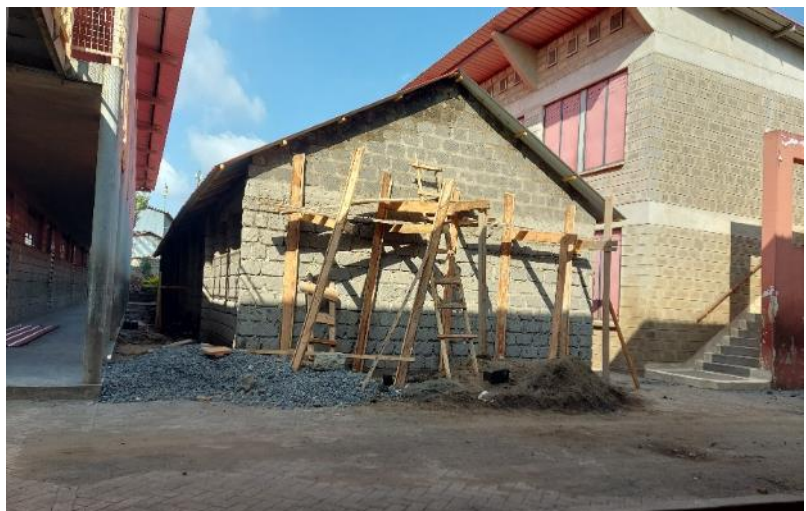
Under construction St Elizabeth Grade 9 Classrooms