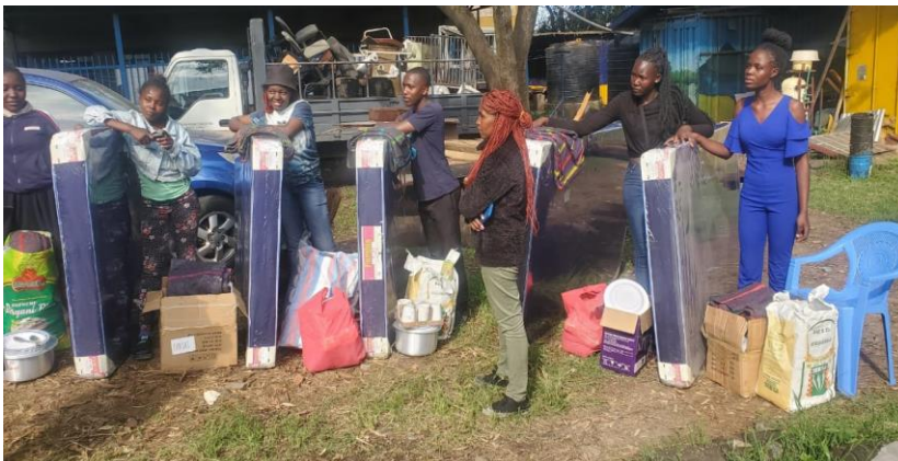
Former Skills students affected by floods and demolitions receive household items and bedding courtesy of the Silent Majority Fund.