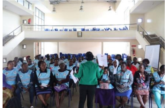
Community health promoters meeting at MPC