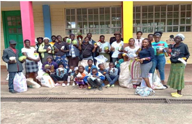
Families of sick children receive food supplements at St. Catherine's from Pablo Horstman Foundation

The Department carried out 3 food distribution exercises to support needy families and families with chronically and terminally ill children. The distribution exercises were done at the beginning of the month, mid-month, and at the end, whereby needy families received food packages to help ease the burden of providing meals for their children. Families with sick children received food items to help boost the children's immunity, significantly improving their health. These families were incredibly grateful for the Christmas package and our donors who made it possible to put a smile on their faces.