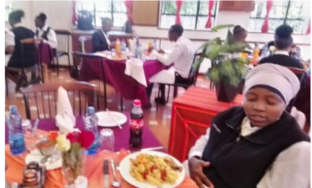
Food and Beverage Orientation at Kibondeni

Before closing for the year, the Centre diligently reviewed all the 2024 activities, demonstrating our commitment to continuous improvement. Staff suggested better ways to bridge the identified gaps, ensuring that we are always striving for excellence. To conclude the year, the Centre celebrated Mass and shared lunch with the rest of the MPC staff, fostering a sense of unity and shared purpose.