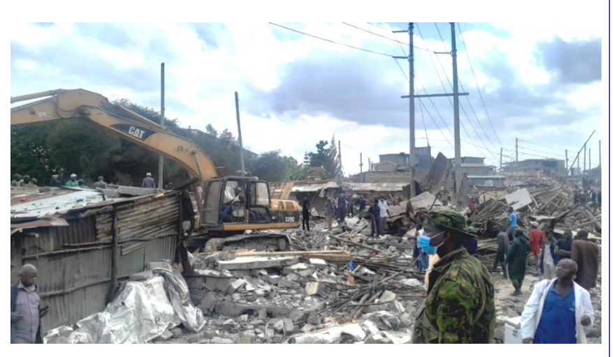
Massai Village behind St Bakhita Primary School

The demolitions, now in their second month, have had a devastating impact on the affected families. Many were caught off guard, lacking the necessary funds to relocate.