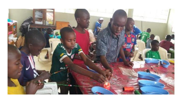
Boys making the bracelets

The boys' creative talents have shone brightly in the art classes this month. Their paintings, a tribute to their growing skills, will hang on the walls of the ASKEA Exhibitions Gallery. The art workshop was also busy making bracelets for gifts Ireland's National Symphony Orchestra.