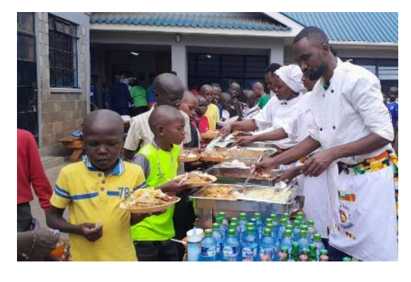
Buffet from St. Charles Lwanga Jumuia