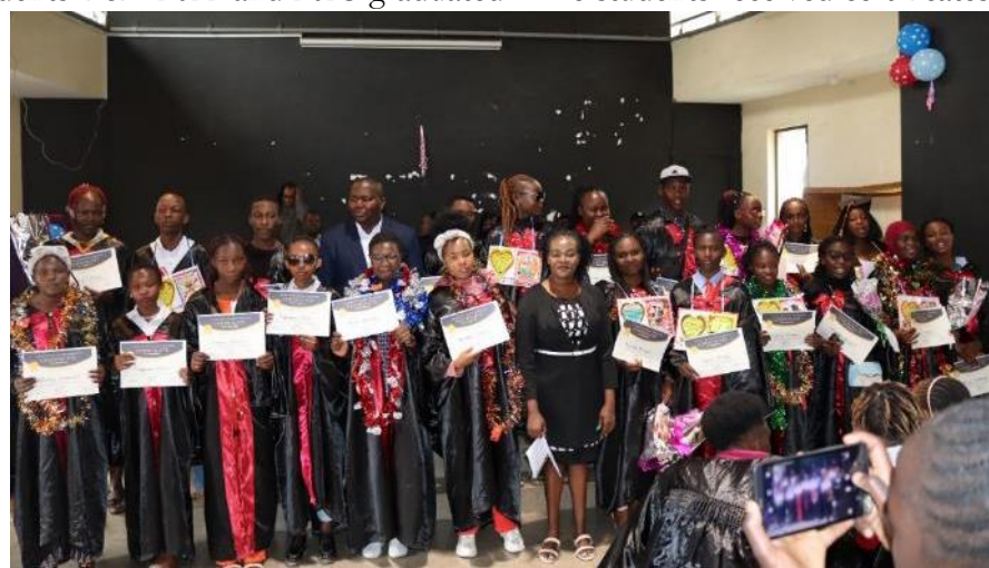
Some of the 2022 and 2023 Graduands.

of completion, a testament to their hard work and dedication, while awaiting their NITA certificates. Despite the challenging circumstances in the country, with rioting and demonstrations, not graduates could attend the We extend our ceremony. gratitude to everyone involved preparation and participation, making this event a resounding success.