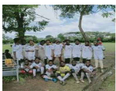
St Michael's Girls Soccer Team