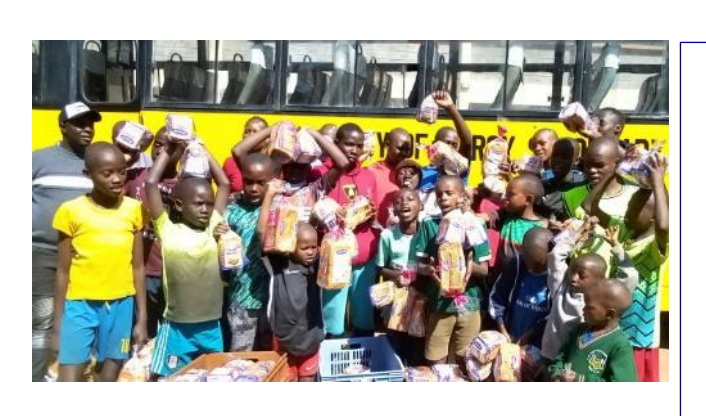
Bread from Our Lady of Mercy Secondary School