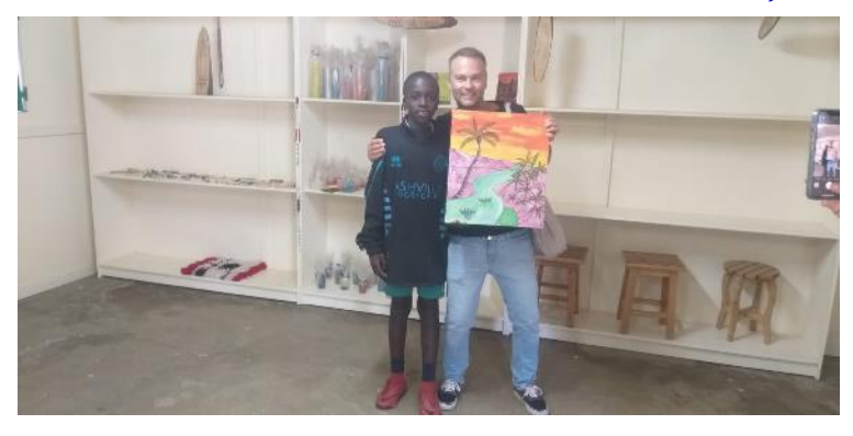
Souvenir shop Up and Running