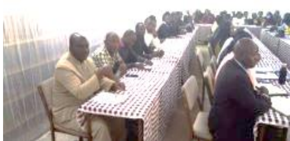
Symposium at Buruburu Girls School

The June activities continued with professional development sessions for teachers. The subject symposiums enabled the teachers to keep up with the current curriculum implementation and evaluations. The subjects included Geography and History for Heads of Department and senior teachers. Other teaching staff completed further Child Protection training.