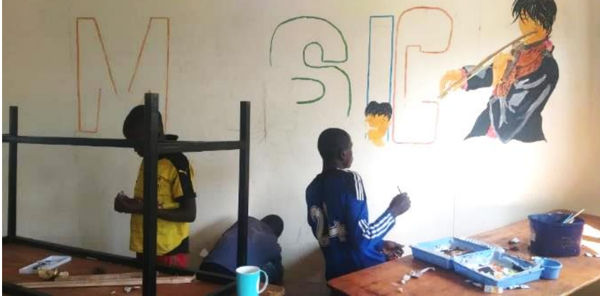
Adding ambience to the music room