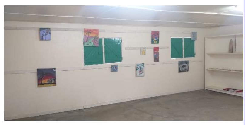
ASKEA Gallery Exhibition room stocked with the boys paintings and artefacts