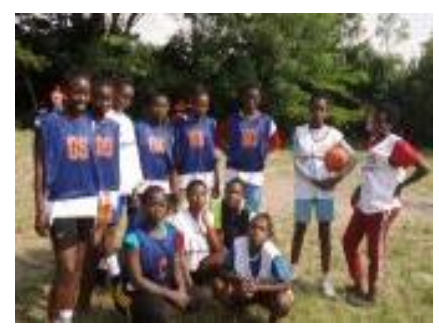
St Michael's Netball Team

St Michael's Girls Netball Team performed well, given that they only started playing in May, to reach the quarterfinals beaten by the National champions from Buruburu Girls.