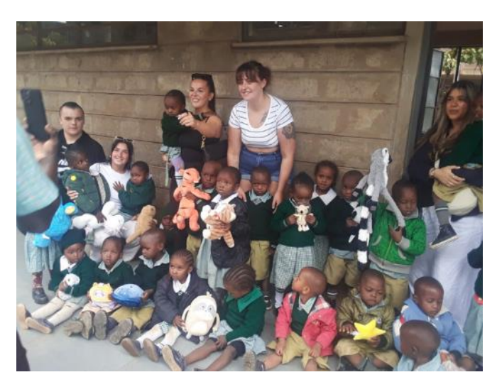
St Elizabeth Children received some toys from the BA crewmembers

St Elizabeth Primary School mother and son were left homeless and without clothes or food after the recent fire destroyed their shanty in Mukuru Kwa Rueben.