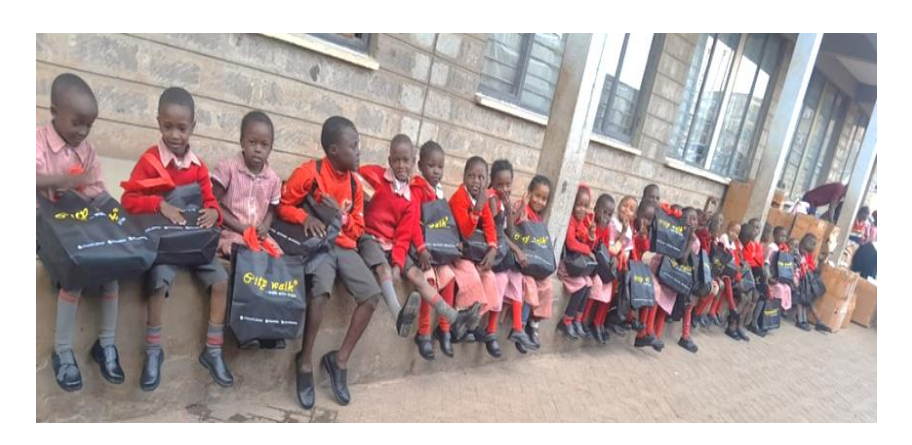
Children love their new shoes from Tuawn!

Some of the children at Sancta Maria Primary School received new shoes as most of them had been lost or destroyed. The shoes will help to reduce diseases as the children walk through lots of rubbish and muddy valley ways to get to school.