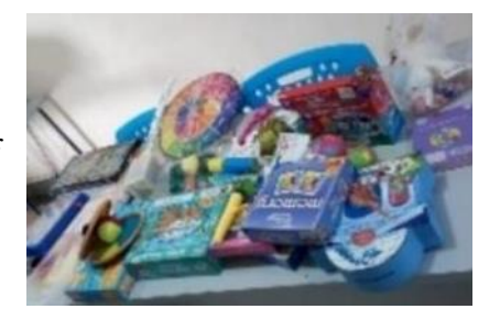
Some of the donated items

The Centre has been receiving local and international donations of different kinds ranging from food provisions to learning materials.