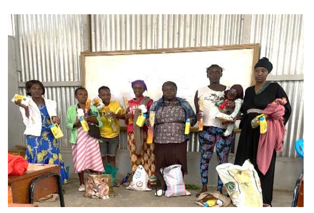
Second Chance Group

During school holiday breaks, sponsored students participate in community service activities at MPC, a tangible way for them to show appreciation for their donors' generosity and to learn new skills. For former prisoners, the transition to life after prison can be challenging, as many aspects of their lives have changed. The Second Chance Program offers community service activities to help them effectively reintegrate into society. These programs are not just about engagement and skill-building; they play a crucial role in preventing reoffending after serving time. Community service activities provide former